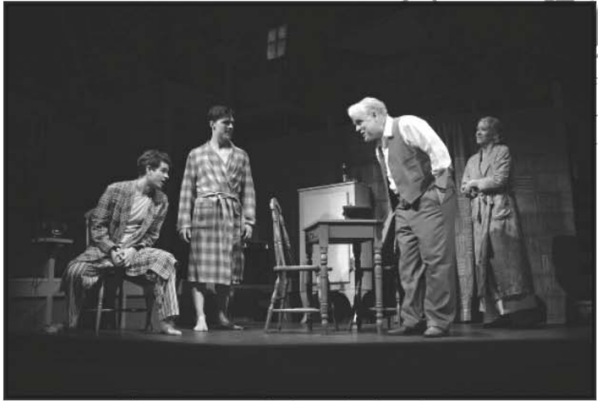
The 2012 revival of Death of a Salesman