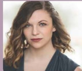
Judge Hathorne The local judge assigned to the Witch Trials; serves as second to Danforth