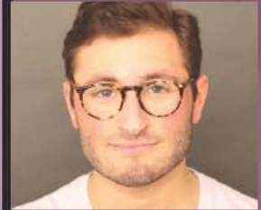
Giles Corey A kind, but talkative, farmer who lives just outside Salem; he and Proctor are friends