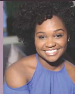
Mary Warren The Proctors' maid and a friend of Abigail