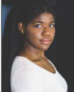
Tituba Parris' slave, who is accused of witchcraft after singing and dancing in the woods with the girls