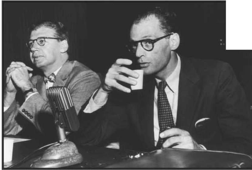
Arthur Miller testifying to a HUAC Subcommittee in 1956.

In 1938, the House Un-American Activities Committee was created to investigate alleged disloyalty and subversive activities on the part of private citizens, public employees, and potential Communist ties. Hoping to apprehend Communists and Communist sympathizers, HUAC was known to pressure witnesses to surrender names via subpoenas and hold people in contempt of Congress. Witnesses who refused to comply were labeled as “red,” and their tactics of harassment were labeled “redbaiting;” these created the term “Red Scare,” which refers to the fear of communism and the fear of the HUAC hearings.