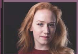
Ezekial Cheever A tailor turned clerk of the court