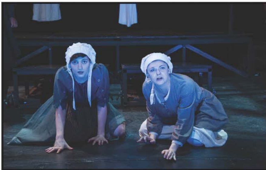
Mercy Lewis and Abigail Williams react to witchcraft in the courtroom scene of NP Tour 70's Production of The Crucible .

As an added component, students can add the difference between the perception of magic based on gender; that is, why female witches were so separate from ‘wizards,’ or that while there is a more direct male counterpart to the word witch (warlock), why there isn’t a direct female counterpart to wizard, it’s still “witch.”