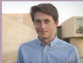
John Proctor A farmer who lives just outside Salem with his wife Elizabeth and their four sons; months prior to the play beginning, he had an affair with Abigail Williams