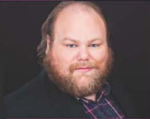
Reverend Parris The minister of Salem's court, disliked by many in his community