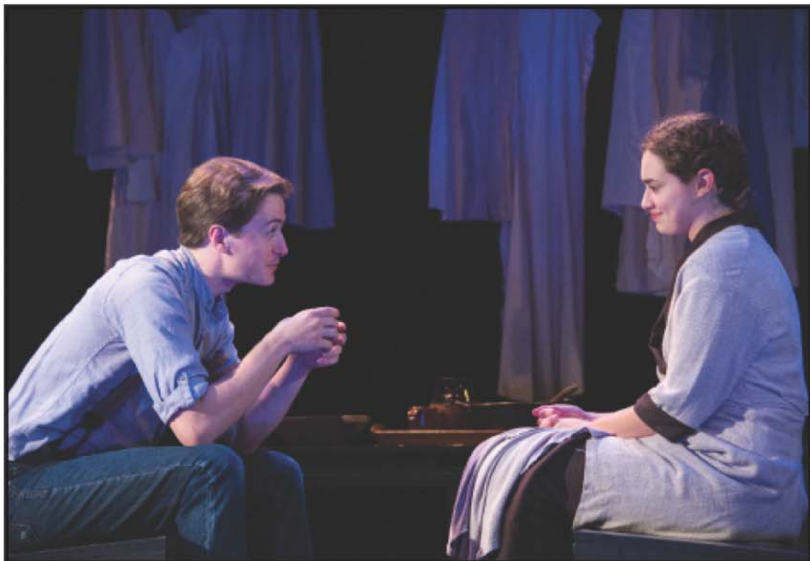
John and Elizabeth Proctor have a conversation in their home in NP Tour 70's Production of The Crucible.

I hope that seeing this show starts an in depth conversation about America today. I hope that, eventually, our America will be so far different from The Crucible that it won't even be relatable anymore. Until that day comes, I hope this play calls out the shortcomings of America, the dangers and terrors of mob mentality, and the unacceptable wrongdoing of sexism and racism.