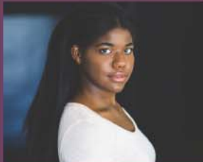
Mercy Lewis their servant, friend of Abigail, one of the primary accusers in the trial