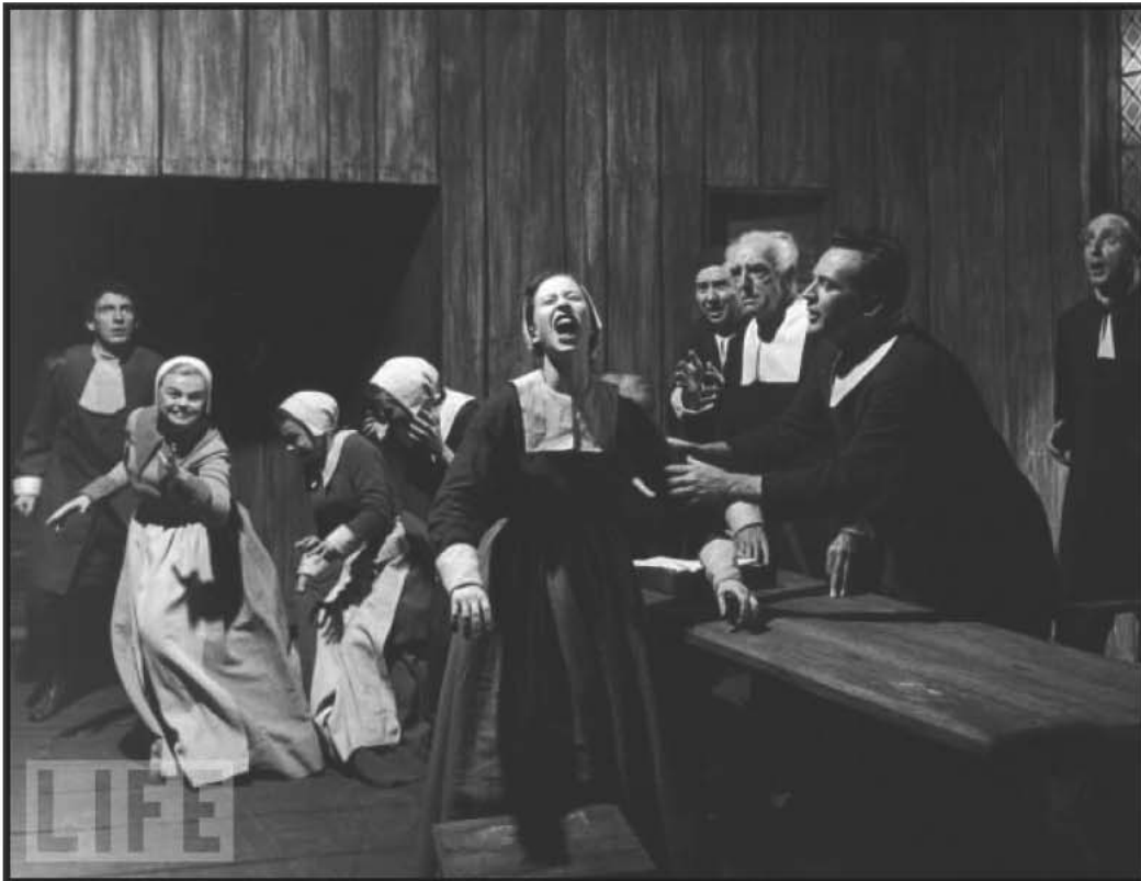
An image from the original production of The Crucible in 1953.

The Crucible opened at the Martin Beck Theatre on Broadway on January 22, 1953, though Miller found this production too stylized and cold. Indeed the reviews for it were hostile, though it won the 1953 Tony Award for Best Play regardless. A year later, a new production “succeeded” that one and has since become a staple of American drama. The Broadway production featured Madeleine Sherwood as Abigail Williams, Arthur Kennedy as John Proctor, and Beatrice Straight as Elizabeth Proctor.