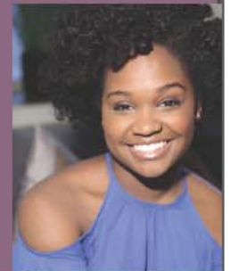
Rebecca Nurse An older and respected member of the Salem community, later hanged for witchcraft