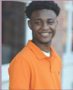
Reverend John Hale An expert on witchcraft, Hale is called in to examine Betty Parris