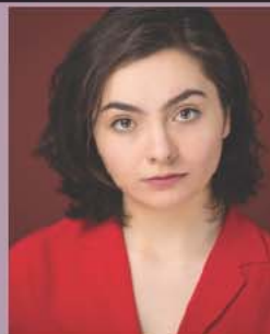
Elizabeth Proctor John Proctor's wife and mother to three sons, accused in the play of witchcraft