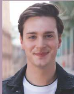
Judge Danforth A Boston judge, called in to preside over the Witch Trials